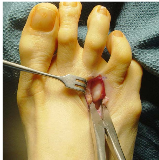
Figure 2 The transverse metatarsal ligament has been divided revealing the neuroma.