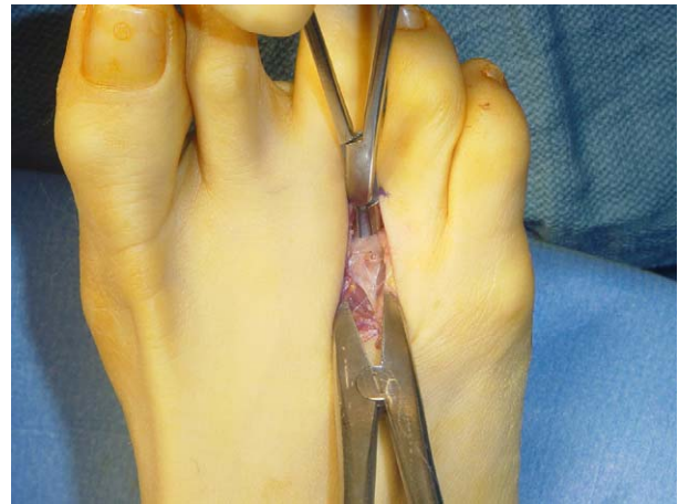
Figure 1 A lamina spreader is placed between the metatarsals to put the transverse metatarsal ligament under tension. A haemostat protects the underlying nerve.

The deep tissues are closed with buried interrupted 4-0 absorbable sutures. The skin is closed with 4-0 nylon sutures using a 'no-touch' technique.