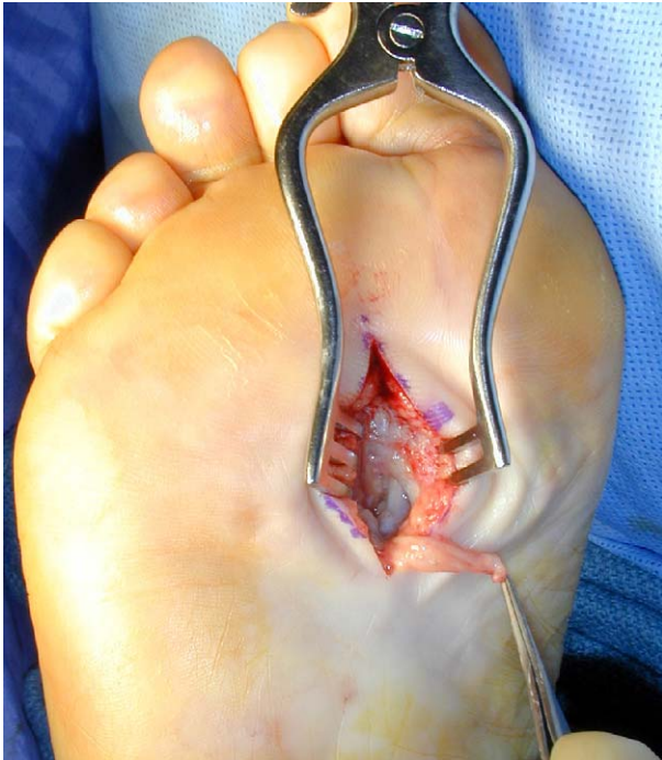
Figure 5 The plantar approach for revision surgery. The nerve is subcutaneous.