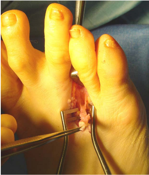
Figure 3 The cut distal ends on the nerve are grasped with a haemostat. The nerve is gently elevated and dissected proximally. The small plantar nerves should be identified and divided.

A plantar incision is made just proximal to the web space and extends at least 4 cm proximally, equidistant between the metatarsal heads and shafts.